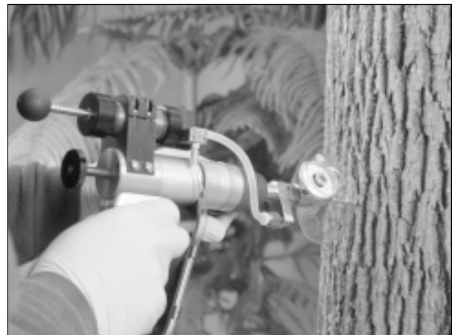
Figure 1. The Arborjet VIPER injection device, equipped with tree gauge to indicate injection pressure in the sapwood, and top-mounted, 10 mL Dose-Sizer™ to measure amount of formulation applied.

trunk. The Arborjet VIPER system was selected for use in therapeutic treatments in this study (Figure 1).