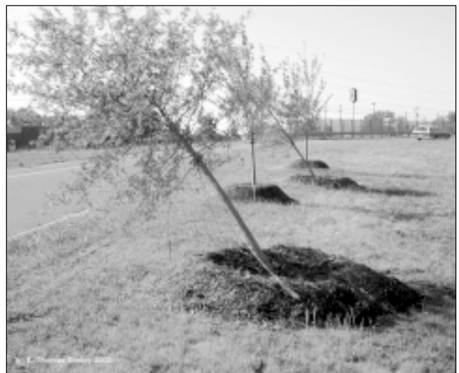
Figure 1. Wooden stakes were pulled out of the soil as a result of thunderstorm winds on these willow oaks ( Quercus phellos ) in Charlotte, North Carolina, U.S.

This trial was conducted to determine which, if either, of these directions provides better resistance to wooden stake extraction. Since it is difficult to simulate the dynamic action of trees responding to wind, a steady force was used that more closely simulates the constant pull that vandals might exert on tree trunks.