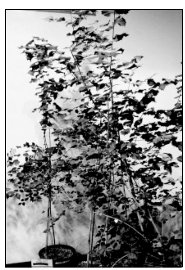
Figure 3. Genetically modified English elm ( Ulmus procera ) growing in soil.

English elms with modified growth habit as a result of Ri plasmid gene expression and phenotypically normal English elms genetically modified with \beta -glucuronidase antifungal protein genes have been produced (Gartland et al. 2000, 2001a, 2001b) (Figure 3). Ulmus procera has some measure of in-built containment, as it does not form viable seed in UK conditions being propagated vegetatively. Elms in the United Kingdom, as well as in North America, hold great