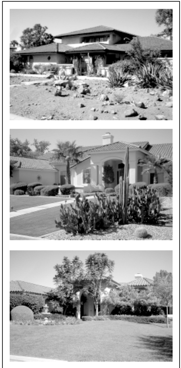
Figure 2. Typical desert (top), oasis (middle), and mesic (bottom) landscape design motifs of residential homes studied in the Phoenix, Arizona, metropolitan area.

We hypothesized that people relocating to Arizona from less arid climates, such as in the eastern United States, would prefer green landscapes because they are legacies of a former home and because these homeowners are recalcitrant to accept the principles of xeriscape landscape design and desert landscaping that are more popular among long-standing Arizona residents. We tested these hypotheses by determining if homeowner's geographic place of origin and length of Arizona residency had an influence on preferences for desert, oasis, or mesic landscape motifs. Surprisingly, we found that the average length of Arizona residency for homeowners preferring desert, oasis, or mesic landscape designs was 9.2 \pm 0.6 , 11.7 \pm 0.5 , or 10.8 \pm 0.9 years, respectively. We also found that the lowest percentage of respondents (16%) who preferred desert landscape themes and the highest percentage of respondents (33%) who preferred mesic landscape themes were Arizona natives (Table 4).