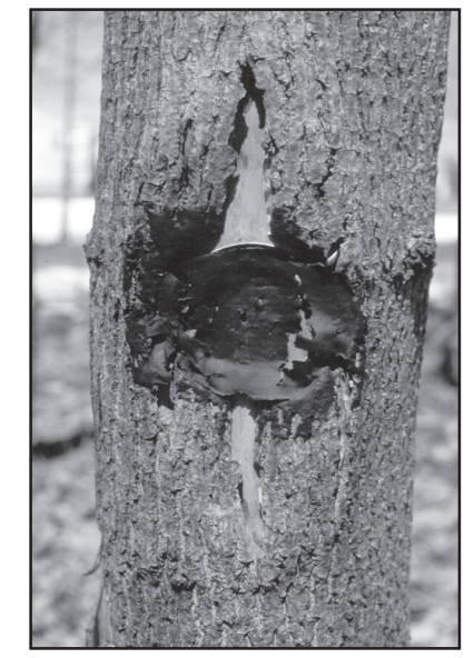
Figure 2. Wounded Norway maple treated with Lac Balsam in November and photographed one year later.

For honeylocust wounded in the fall and measured 24 months after wounding, there was no significant difference in the extent of discol-