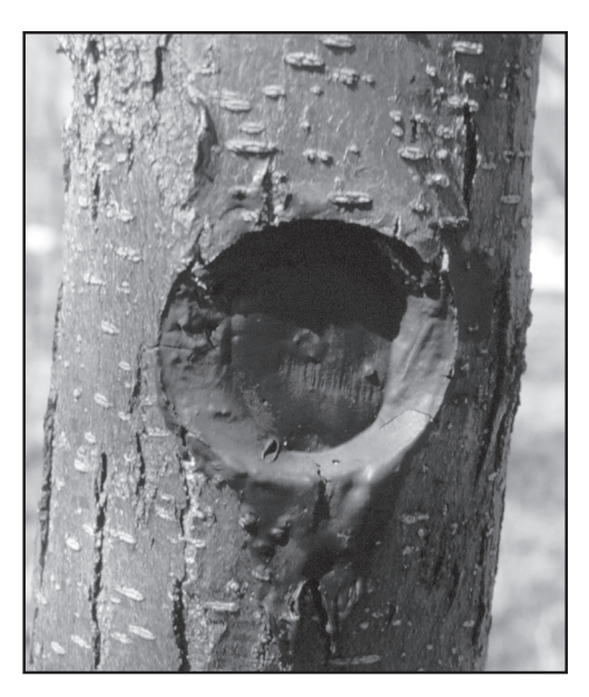
Figure 1. Wounded honeylocust treated with Lac Balsam in June and photographed in November of the same year.

Where Binab amendments were used, an off-white to gray mold ( Trichoderma spp.) was visible against the darker gray Lac Balsam surface. With all treatments on honeylocust and Norway maple, Nectria cinnabarina also appeared commonly, growing on bark and coating near the edges of the wounds but apparently not causing death of living phloem or creating enlarging cankers. Two species of wood decay fungi occasionally fruited on both