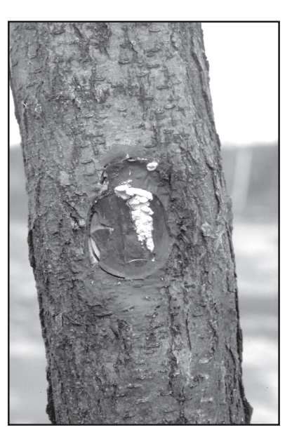
Figure 3. Lac Balsam-treated wound on honeylocust with fruit-bodies of Irpex lactuae on exposed wood.

For honeylocust wounded in the spring and measured 16 months after wounding, application of any one of the dressings considered in this study significantly reduced the length of the