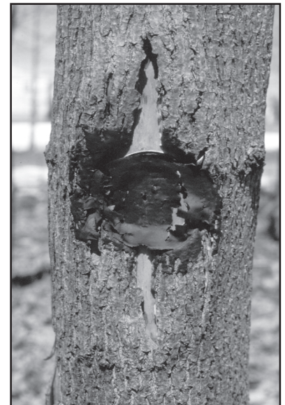
Figure 2. Wounded Norway maple treated with Lac Balsam in November and photographed one year later.

For honeylocust wounded in the fall and measured 24 months after wounding, there was no significant difference in the extent of discolored wood following any of the treatments as compared to untreated wounds (Table 1). The average circumferential distances between woundwood rolls on wounds treated with Lac Balsam and Lac Balsam + Binab were significantly greater ( P = 0.05 ) than un-