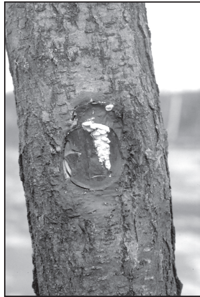
Figure 3. Lac Balsam-treated wound on honeylocust with fruit-bodies of Irpex lactuae on exposed wood.

For honeylocust wounded in the spring and measured 16 months after wounding, application of any one of the dressings considered in this study significantly reduced the length of the