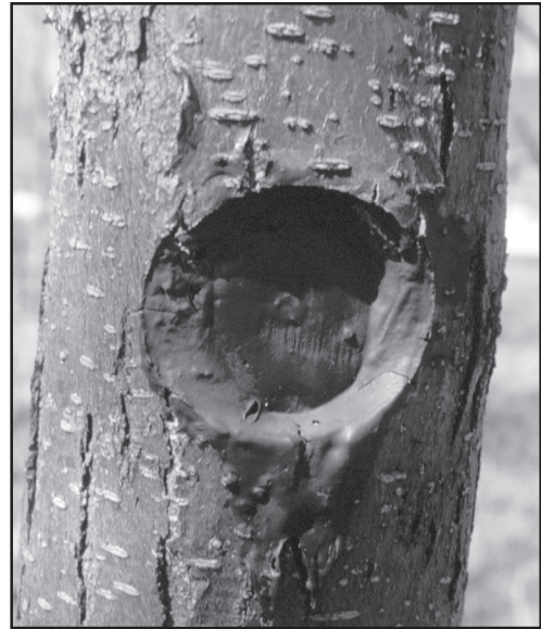
Figure 1. Wounded honeylocust treated with Lac Balsam in June and photographed in November of the same year.

Where Binab amendments were used, an off-white to gray mold ( Trichoderma spp.) was visible against the darker gray Lac Balsam surface. With all treatments on honeylocust and Norway maple, Nectria cinnabarina also appeared commonly, growing on bark and coating near the edges of the wounds but apparently not causing death of living phloem or creating enlarging cankers. Two species of wood decay fungi occasionally fruited on both