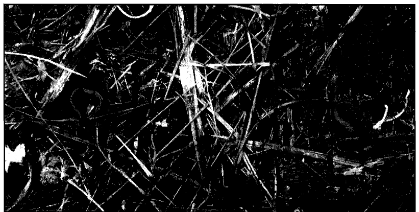
Figure 3. Two Jefferson salamanders beneath a large coverboard in the wire zone of a foliage spray unit. The Jefferson salamander was the most common salamander found on the ROW and in the adjacent forest. This is a large salamander, which is usually at least 10 cm (4 in.) long. It typically prefers damp woods near water and feeds on a variety of insects, grubs, and earthworms.

The number of species per treatment unit varied from six species in the mowing plus herbicide unit to three each in the stem-foilage and foliage spray units (Table 2). Eighteen and 17 observations of amphibians and reptiles were found in the handcutting and stem-foilage spray units, respectively; 11 to 12 observations were found in mowing, mowing plus herbicide, and foliage spray units. All units, including handcutting, were relatively heterogeneous in cover types, thereby providing a diversity of habitat for amphibian and reptile species. In contrast, the handcutting unit on the