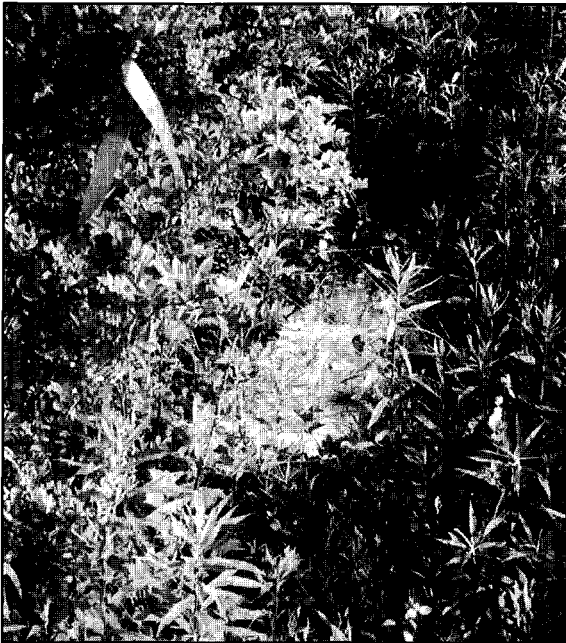
Figure 2. A large coverboard at a sampling point in a foliage-spray unit (photo taken by RHY in June 1999).

zones, border zones, and adjacent forest. In 1999, rocks and logs were overturned to check for amphibians and reptiles for comparison to data collected beneath coverboards. However, rocks and logs were very scarce along the ROW and adjacent forest, and no amphibians or reptiles were found under rocks or logs (Yahner et al. 1999a).