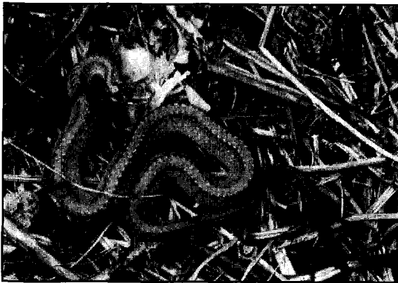
Figure 3. A northern redbelly snake under a coverboard in a stem-foliage spray treatment unit in May 1999. This species, which feeds on insects and other invertebrates, was the most common snake found on the ROW. Adult redbelly snakes are only about 20 to 25 cm (8 to 10 in.) in length. They are very secretive and are seldom found, even by those who spend a considerable time in the outdoors. Thus, the use of coverboards is an effective way to monitor this species on a ROW.

The number of species per treatment unit varied from six species in stem-foliage spray to three in handcutting (Table 2). Twenty-four reptiles and amphibians were found in each of the high-volume basal spray, stem-foliage spray, and foliage spray units. The shrub-forb-grass cover types in these three units provided a diverse habitat for a variety of reptiles and amphibians. In contrast, only four reptiles and amphibians were noted in handcutting. The cover type in this unit was relatively homogeneous and was similar to young, even-aged forest stands, which are of little value to amphibian and reptiles as habitat (Rodewald and Yahner 1999).