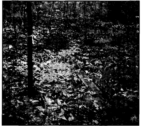
Figure 2. A large coverboard (background) and a small coverboard (foreground) are seen at a sampling point in the forest adjacent to the right-of-way.

Three sampling points were established in the wire zone, in the border zone, and 40 m (131 ft) into the adjacent forest in each treatment unit, giving nine sampling points per unit. A distance of 40 m from a forest edge was used for sampling points into the adjacent forest because woodland salamanders may be relatively scarce within 25 m (82 ft) of edges (deMaynadier and Hunter 1998). At each sampling point, one large coverboard (waferboard, approximately 30 \times 120 \times 1.5 cm [ 12 \times 48 \times 0.6 in.]) and three small coverboards (untreated pine, approximately 15 \times 90 \times 2 cm [ 6 \times 36 \times 0.8 in.]) were placed flush with the soil surface (DeGraaf and Yamasaki 1992; Rodewald and Yahner 1999; Yahner et al. 1999b) (Figure 2).