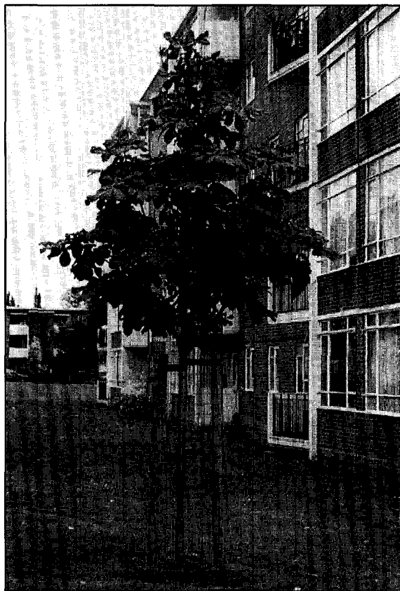
Figure 1. Tree supported with 2 stakes and protected with a wire mesh cage.

to either rule out or encourage the possibilities for tree planting. A decision was made to apply the same available funds as previous years to purchasing 16% of the quantity of the previous year but of larger, higher quality trees. Two hundred containerized advanced nursery stock (ANS) 16- to 18-cm girth (4-in. caliper) trees were selected specific to the identified site but based on nursery stock availability lists and historical success rates. To this end, species included Crataegus monogyna , Sorbus aria , and S. × intermedia , Platanus acerifolia , Fraxinus oxycarpa 'Raywood' and F. excelsior 'Jaspidea', Acer pseudoplatanus 'Leopoldii', and Aesculus hippocastanum 'Baumanii'. It was also decided to protect each tree with a weld-mesh galvanized guard supported by 2 diametrically opposed pressure-treated round wood stakes (Figure 1). To avoid accumulation of litter in the guard, a gap of about 200 mm (8 in.) was left between the bottom of the guard and ground level. Each tree was supported by rubber-sleeved strapping at