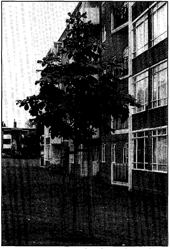
Figure 1. Tree supported with 2 stakes and protected with a wire mesh cage.

to either rule out or encourage the possibilities for tree planting. A decision was made to apply the same available funds as previous years to purchasing 16% of the quantity of the previous year but of larger, higher quality trees. Two hundred containerized advanced nursery stock (ANS) 16- to 18-cm girth (4-in. caliper) trees were selected specific to the identified site but based on nursery stock availability lists and historical success rates. To this end, species included Crataegus monogyna, Sorbus aria, and S. × intermedia, Platanus acerifolia, Fraxinus oxycarpa 'Raywood' and F. excelsior 'Jaspidea', pseudoplatanus 'Leopoldii', and Aesculus Acer hippocastanum 'Baumanii'. It was also decided to protect each tree with a weld-mesh galvanized guard supported by 2 diametrically opposed pressure-treated round wood stakes (Figure 1). To avoid accumulation of litter in the guard, a gap of about 200 mm (8 in.) was left between the bottom of the guard and ground level. Each tree was supported by rubber-sleeved strapping at