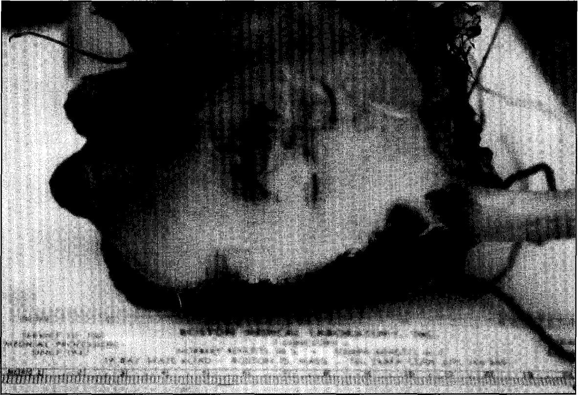
Figure 3. Cross-section of buttress of American chestnut 24 hours after trunk injection of 2% acid fuchsin dye in July. Note inward movement of dye across several years of xylem tissue.