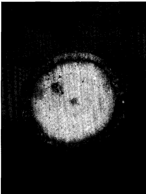
Figure 4. Cross-section of American chestnut stem at 90 cm (3 ft) above ground 24 hours following trunk injection of 2% acid fuchsin dye in July. Note that dye is confined to large springwood vessels in the current year of xylem.