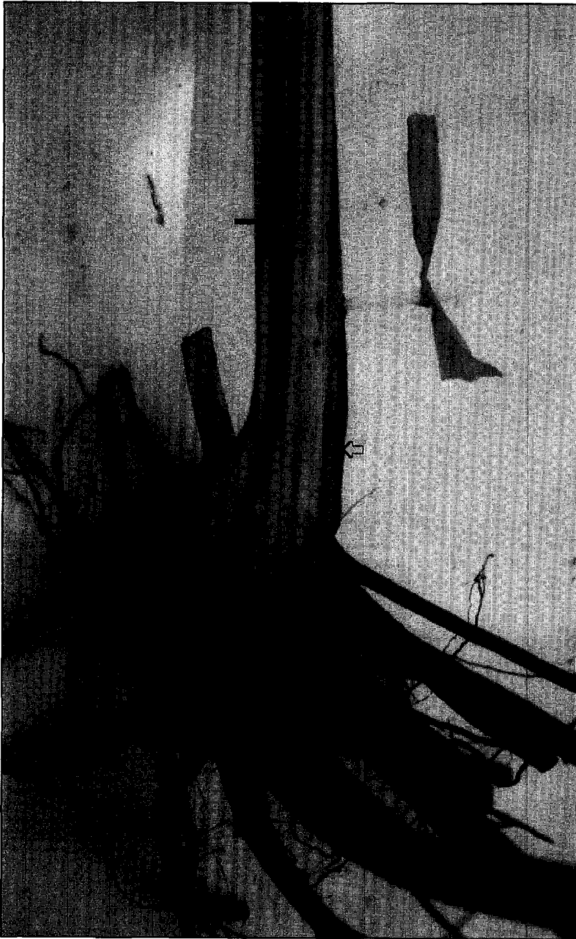
Figure 5. Upward movement of 2% acid fuchsin dye (solid arrows) after initial downward dye movement from an injection wound on the opposite side of the trunk on an American chestnut in July. Note position of plastic feeder tube with flag attached (hollow arrow) indicating position of injection wound.