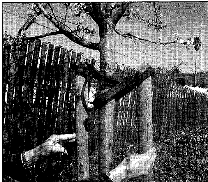
Figure 6. Slight lateral pressure with fingers moved (bent) stakes more than 15 cm (6 in.) after 1 year of continuous stem and crown movement by wind. This photograph demonstrates that even "rigid" double stakes stiffened with 2 ties to the stem could only partially oppose sideways stem deflection after 1 year.

The BT-supported stems, which were observed to sway in the wind more freely than those of TS or DS trees (as demonstrated in Figure 2), had the greatest stem taper. Prevention of stem swaying of Pinus taeda reduced stem taper (Burton and Smith 1972). The BT-supported Pyrus trees retained highest taper even after the supports were removed and all trees swayed normally. Interestingly, after the stem supports were removed, stem taper of DS-trees increased most (Table 1), as would be expected.