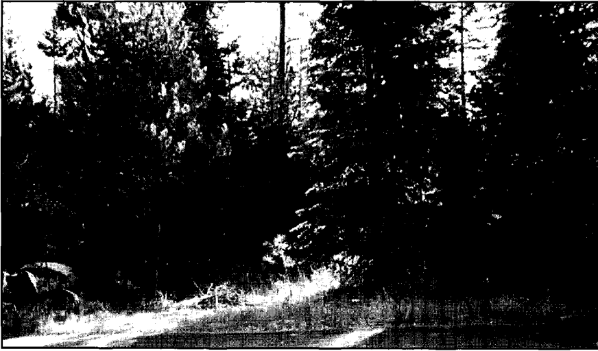
Figure 3. A typical LTB property in need of arboricultural treatment.

health do not arise solely from the aesthetic effects. Fire risk in the Lake Tahoe Basin, like many urban interface areas in the U.S. west, has become widely recognized by residents recently, and markets may reflect the benefits of reduced fire risk from managed improvements. Such benefits, however, are inherently jointly produced from proper tree and stand care.