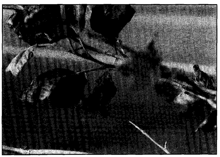
iams and Moser 1975). The threshold Figure 1. Saltwater spray desiccation of leaf margin and tip on level can be reached with 1 or 2 high- London planetree growing along Atlantic Avenue.

A general crown thinning may occur as salt buildup in the soil causes soil structure destruction and root damage. In addition, trees may be deformed or misshapen due to greater damage on the