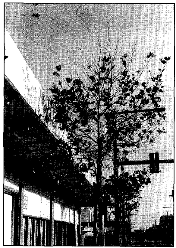
Figure 2. Saltwater spray defoliation of tops of London planetrees along Atlantic Avenue where tree heights exceeded protective building heights.

change or lessen the sodium chloride content of oceanwater spray. Therefore, in selecting landscape trees for areas exposed to oceanwater salt spray, it is necessary to find species that will remain aesthetically acceptable after repeated salt spray exposure.