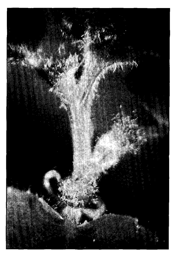
Figure 3. Transgenic early-flowering poplar. A male hybrid (P. tremula × P. tremuloides) was engineered to constitutively express the LEAFY gene from Arabidopsis (gene was provided by D. Weigel, Scripps Institute). Photo was taken 7 months after the gene was introduced via Agrobacteriummediated transformation. Plant shown is about 13 cm (5 in.) tall; single flowers are seen in the axils of leaves. Normally, inflorescence meristems first arise in leaf axils, followed by initiation of floral meristems along the flanks of the developing inflorescence (i.e., the catkin). The stamens are clearly visible; the perianth cup is a disc-like structure at the base of the flower that is homologous to sepais and/or petals, but is mostly obscured by the stamens.

following transformation (Figure 3; Weigel and Nilsson 1995), though it appeared to be effective only in selected poplar genotypes (unpublished data). Flowers were normal in appearance; however, they formed directly from vegetative meristems in the absence of inflorescence shoots.