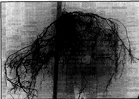
Figure 2. Side view of sheltered (top) and unsheltered (bottom) redwood root systems 4 years after replanting. Note the differences in root diameter and volume between 2 treatments. A displayed detail of fine roots demonstrates reliability of the Vector vacuum soil extraction technique for collecting data on tree roots.