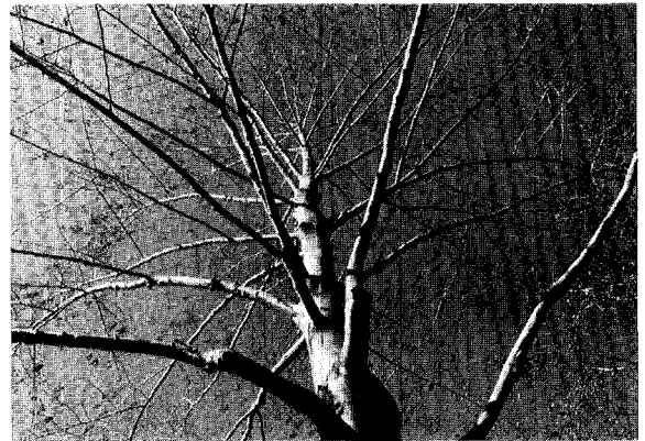
Figure 5. Eradicative pruning maintained natural character of white alder, but it radically opened canopy, making the tree susceptible to sunscald.

gen develop. Prevent inoculation of a disease organism into pruning wounds by sterilizing cutting tools (bleach, Physam, 75% alcohol, or alcohol-based Lysol), and spray pruning wounds with a fungicide or bactericide when recommended by a plant pathologist.