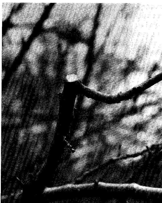
Figure 3. Cut made seven inches below the canker, next to the lateral, eradicated infection from the branch.

The techniques of eradicated pruning cuts are nearly identical to those of general pruning except that, by eradicated pruning the arborist traces the pathogen or pest to excise an infection or infestation to prevent a tree's death or further progress of branch dieback. This technique differs from other types of pruning, such as for maintenance, health (sanitation), size control, flowering, fruiting, and vigor (15), in which predictable tree growth, form, and habit are the factors and not a life-threatening pathogen or pest. Thus, the recommendation of timing for these other types of pruning (15,19,27) must be adjusted to the life history of the pathogen/pest threatening the tree in the area. For example, spread of certain fungal or bacterial diseases is reduced by preventing branch crowd-