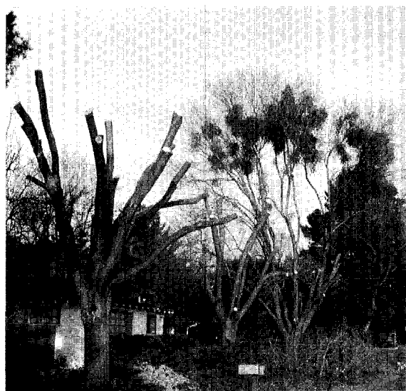
Figure 7. Modesto ash heavily infected by leafy mistletoe.

The guide (Tables 1 and 2) highlights important aspects of the biology and natural history of the