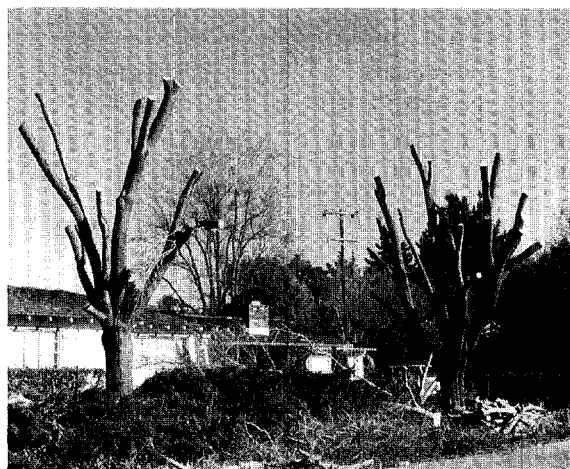
Figure 8. This is absolutely not eradicated pruning.

host plant and the pathogen or insect as well as timing of eradicated pruning described in a variety of sources (1,6,8,13,17,28,30,32). However, it will be the arborist's experience and knowledge of local conditions that effect a successful application of eradicated pruning.