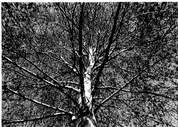
Figure 4. Flatheaded borer infested 29 branches of white alder.

b) Open wounds are an invitation for re-infection by a pathogen via contaminated tools or naturally when climatic conditions favorable to the patho-