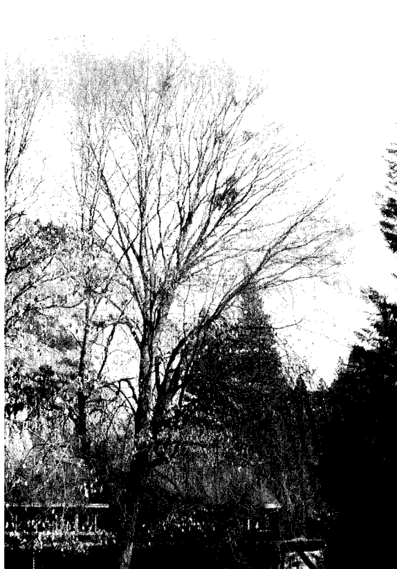
Figure 6. An initial stage of infection by leafy mistletoe in black oak.