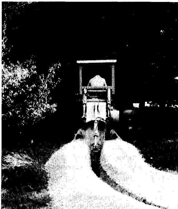
Figure 3. Trenching to break root connections for oak wilt control in the urban environment.

vascular- inhabiting pathogens (9,10,22,29). In addition to being readily systemic with low phytotoxicity, propiconazole also has growth regulator properties that may promote disease control through an influence on tree physiology (11).