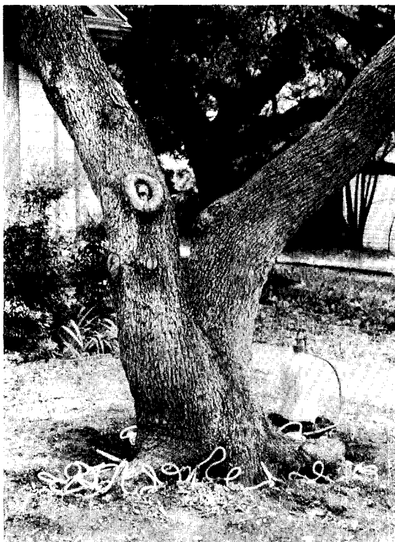
Figure 4. Root flare, high volume injection with propiconazole for oak wilt control in live oak.

Although the research results justify recommending injection, the study revealed many limitations to using propiconazole for disease control.