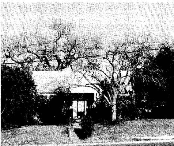
Figure 1. Impact of oak wilt with loss of live oaks on urban property in Austin, TX.

Sap-feeding nitidulid beetles (Coleoptera: nitidulidae) are suspected as primary vectors for overland transmission of C. fagacearum in Texas (6,7). The same group of insects have been also implicated as primary vectors in other states (16). However, the role of nitidulids in Texas is somewhat different. To obtain inoculum, nitidulids require formation of a fungal mat by the pathogen beneath the bark of diseased trees (16,24). Fungal mats attract the beetles with a strong, sweet odor and are covered with sticky spores which easily contaminate the insects when they feed and breed. Mats form on members of the red oak group (sub-genus Erythrobalanus ); they do not form on diseased white oaks (sub-genus Leucobalanus ). In the Mid-Atlantic and North Central U.S., most diseased trees are potential mat formers because the primary hosts in those regions are red oaks. In contrast, mats have never been found on diseased live oaks, the predominant host in Texas. The opportunity for long distance spread is therefore limited in Texas by the proportion of red oaks growing in a disease center. The two most prevalent red oak species in Central Texas are Spanish oak