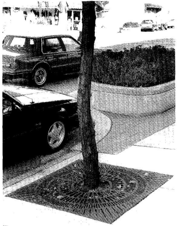
Figure 2. Grade level and raised planters in Downers Grove.

and two sites were within a wide, road-level median. Traffic counts at each site show essentially equal traffic levels (2). The narrow median is 3 m (10 ft) wide and raised 0.8 m (2.5 ft) above the roadway (Figure 1). The wide median is about 30 m (100 ft) across and level with the roadway. One surface soil sample (0-15 cm deep, 0-6 in) was gathered on 28 December 1992 and on 30 March 1993 in the center of each median site.