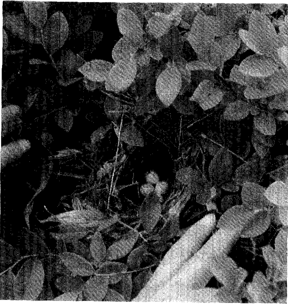
Figure 3. Common yellowthroat nest with 4 eggs located in blueberry on the ROW wire zone on 6/4/91.