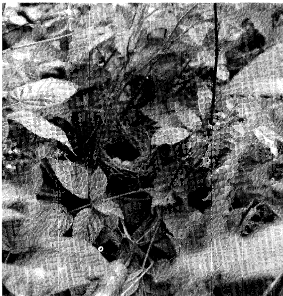
Figure 2. Chestnut-sided warbler nest with 4 eggs located in blackberry on the ROW border zone on 6/11/91.

species not only form large patches on the ROW wire zone, but are also common in openings in shrub cover. The common grasses used for nesting were poverty grass ( Danthonia spicata ) and tall fescue ( Festuca elatior ).