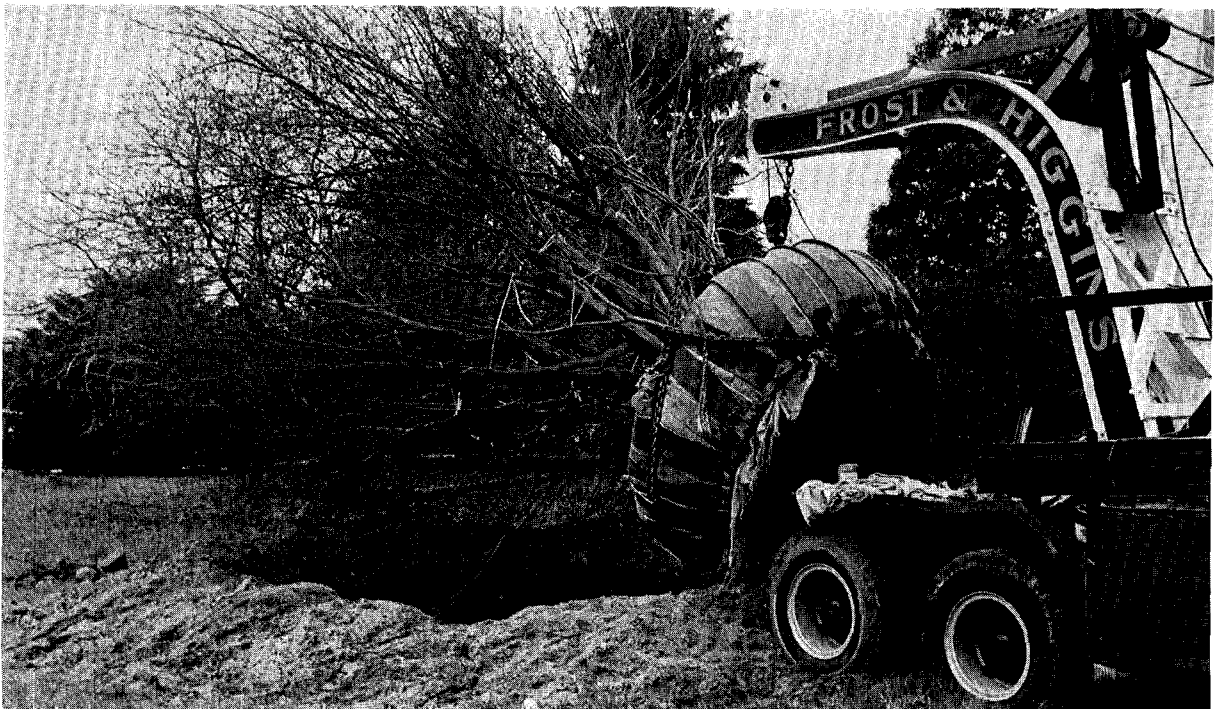
Figure 1. The loading of a large multi-stem Japanes maple; the tree is 22 feet in height and 24 feet in width and had a 9½ foot root ball. Our men dug it at the Bair Lustgarten Nursery on Long Island and transplanted it to Belmont, Massachusetts where it was planted at a private home.

Before any work is done, it should be determined that 1) the tree is healthy and worth transplanting, 2) the tree will survive and prosper in its new environment, 3) the tree is accessible to equipment, etc., and 4) existing soil conditions