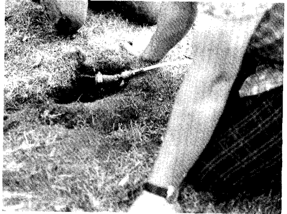
Fig. 3. The roots are cut and a conical root-nipple put over the end.

When the root has been followed out from the tree to the appropriate size, 1-1½ inch in diameter, it is cut and a conical-shaped root-nipple placed over it (Fig. 3).