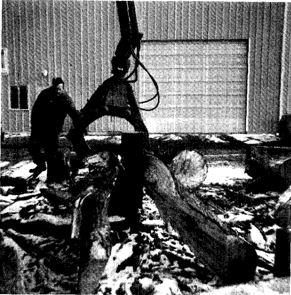
Figure 1. The log splitter operated by Ray Hutchinson at the Brush and Log Facility of The City of Toledo, Ohio.

Solid Logs. For use as playground equipment, sales to sawmills, etc. The facility officially opened for general use in May of 1971.