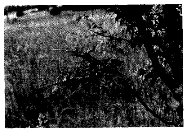
Figure 2. "Witches Broom" on hawthorn caused by dieback of the terminal and the subsequent development of many lateral branches beneath the dead area.