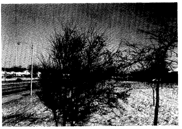
Figure 1. Hawthorn showing typical one-sided effect due to aerial deicing salts. Note fruit on the side away from the highway and the extensive "brooming" on the side closest.

1. Injury is more severe on the side facing the road; plants are one-sided due to branch dieback and often exhibit a "witches-broom" appearance (Figures 1 and 2).