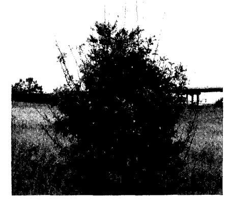
Figure 3. Crabapple showing extensive tip dieback.

Plant injury was evident as far as 150 to 200' from the highway's edge along Chicago freeways. Langille reported Na was significantly increased to distances of 50 feet from the highway's edge after one salting season while soil Cl was increased to a distance of 200 feet. Sodium and CI significantly increased to distances of 200 feet in Tsuga canadensis (L.) Carr, Canadian hemlock, needles after one winter. Williams and Moser (31) have shown that regardless of the rate of deposition, plants will be injured if exposure time is sufficient and that uptake of Na and CI is linear with time (Figure 3). When tissue Cl levels reached approximately 2.7 percent, visual injury was manifested. Their work indicated that whether plants receive salts in low levels or high levels they will exhibit injury symptoms when the tissue Na or CI concentrations reach a threshold level.