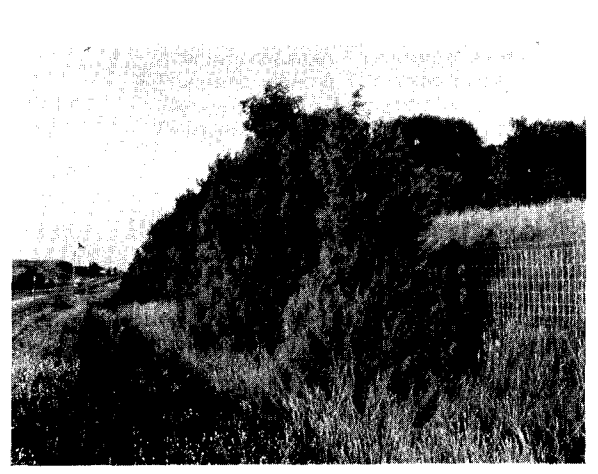
Figure 4. Eastern redcedar approximately thirty feet from the highways edge exhibiting dieback and one-sided habit.

Sodium and Cl accumulate in different amounts in various species (Table 2). The visual injury and degree of salt tolerance correlated closely with the shoot Cl levels. Hedera was more salt tolerant than Viburnum > Pyracantha > Coleus > Cer cis. Chloride levels which induce toxicity symptoms in plants are difficult to compare because of the conditions under which the plants were grown and the tissues sampled. Tissue Na and Cl