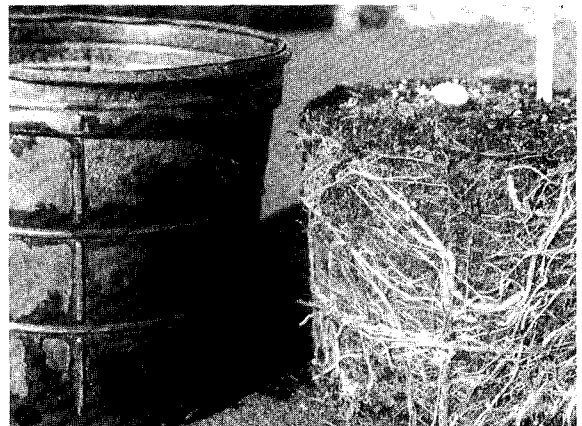
Figure 1. Circling roots that developed on a tree grown in a container.

In-ground fabric containers. In-ground fabric containers, or grow bags, are the oldest of several new hybrid field/container production options (24). Numerous comparative studies of these containers vs. conventional field or container production have been conducted, with some tree species