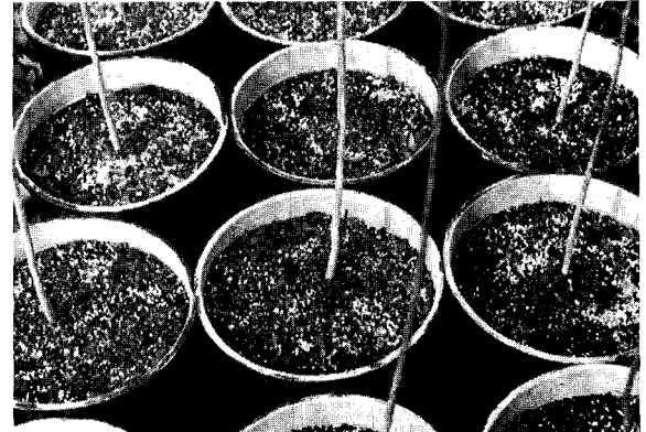
Figure 10. Containers painted with a root-inhibiting copper compound (Spin Out™).

Arborists who have seen tree decline or death