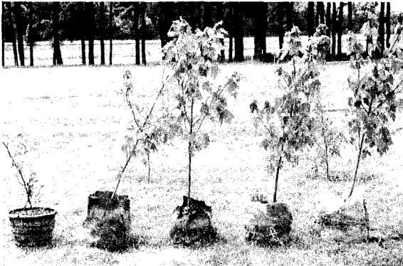
Figure 2. A variety of in-ground container fabrics, and the rigid, in-ground container (left).

In-ground plastic containers. For two major reasons, nurserymen have traditionally been discouraged from trying to grow trees in single, nonporous, rigid, plastic containers sunk into the ground. First, drainage of excess precipitation or irrigation water is impeded by the types of drain