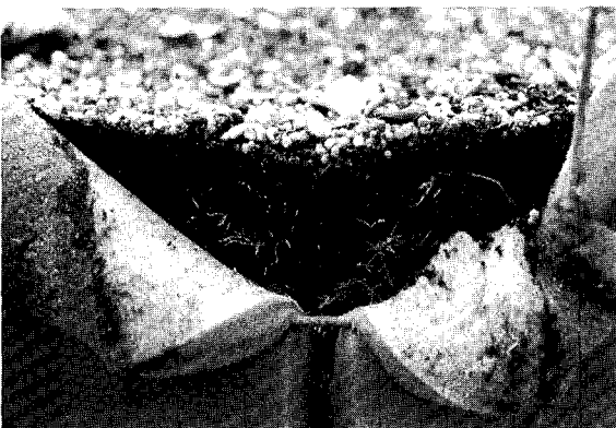
Figure 9. Air-pruned roots inside a "Soil Sock."

absorbed by the root tips from the carrier. The copper acts as a growth regulator, inhibiting root tip growth and stimulating branching. The manufacturer claims that root tips are not killed by the copper as they are with air-pruning.