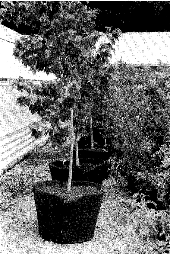
Figure 8. The "Soil Sock" container combining a wire basket with a foam liner.