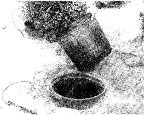
Figure 5. The plant is harvested with and sold in the inner pot while the sleeve pot stays for additional production.

vices (Figure 6), use of non-rigid containers (poly bags), and use of porous-walled containers.