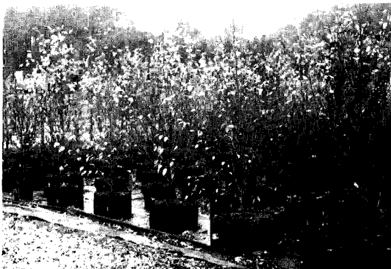
Figure 6. The low-profile container that can be constructed in a variety of widths.

A porous-walled container with pin-hole perforations randomly punctuating the container walls produced roots superior to those in nonporous smooth and nonporous ridged containers (23). Air-root pruning behind the perforations prevented circling root formation except where the plastic