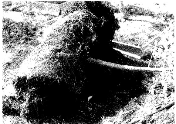
Figure 7. The low-profile container produces a dense, shallow root mat that often can even be rolled up to harvest.

Copper-coated containers. One final strategy for the reduction or elimination of circling root formation is the use of rigid plastic containers with copper-coated interior walls (26) (Figure 10). Applied to the walls in a carrier, the copper is