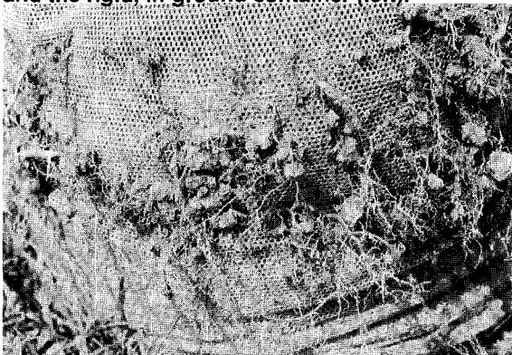
Figure 3. Small roots growing through the in-ground fabric container with the specially designed holes.

holes in the containers, often resulting in water-logged roots. Second, roots are unable to penetrate the containers, preventing them from exploring the soil around the containers for supplemental water and nutrients.