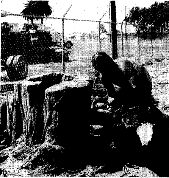
Fig. 5. The same tree being cut near ground level.

called to the banyans (and the Clusias ) whose multiple aerial roots do come to function as stems, and very successfully, the original trunk often disappearing entirely. Although the interior structure of young root and young stem are quite different, these differences disappear with the beginning of secondary growth. Macroscopically, older root and stem are hardly distinguishable,