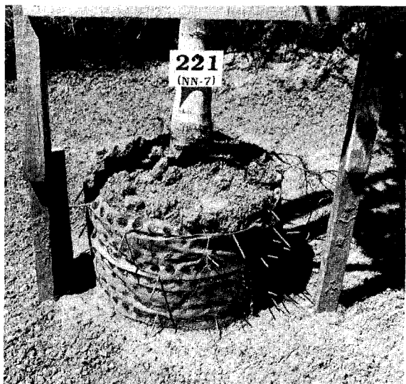
Figure 5. This bio-barrier treatment at experimental planting site—Salono Community College, Salono County, California—exemplifies root barrier treatments that had been installed as planting hole liners when trees were planted three years previous. The planting holes were 18 inches in diameter and the root barriers were installed to a depth of one foot.

relative to the recreational and forest experience expectations of this diverse racial and ethnic population. In addition, research is being conducted on the use of “high tech” equipment in urban forest areas, relative to minimizing environmental degradation of the resource as well as minimizing conflicts with more traditional forest uses and users.