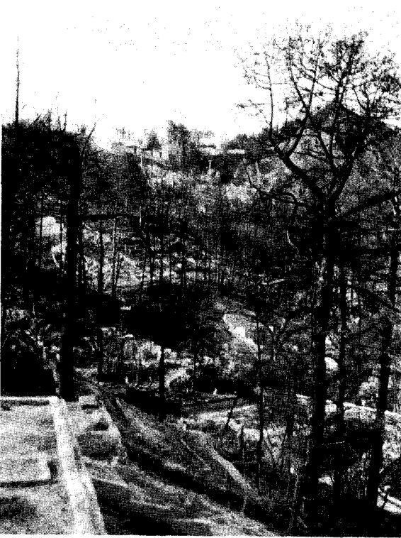
Figure 3. Former residential section of Oakland/Berkeley Hills, California, after the October 20, 1991 fire, the worst urban-wildland interface fire in United States history.