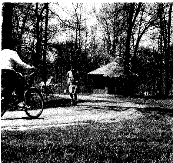
Figure 1. Bicycle trails, like this one in the Chicago area, are increasingly important to urbanites.