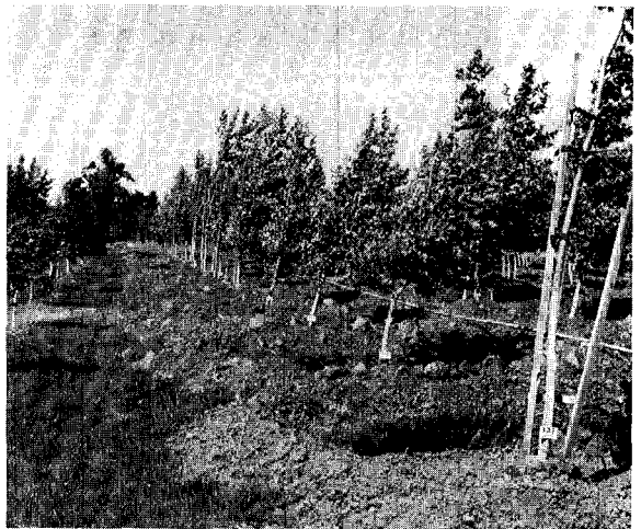
Figure 4. Experiment at Solano Community College—Solano County, California—testing various root barrier treatments to inhibit shallow tree root development. This experiment is comprised of 101 sycamore trees, spaced 15 feet on center, and grown on site three years prior to determination of results.

Southern California. Urban forestry research in Southern California is concentrated on developing information to better serve the 18 million or more annual visitor's to California's four most southerly national forests: The Angeles, Cleveland, Los Padres, and San Bernardino. Many of these visitors are from the greater Los Angeles area. Data developed from the 1990 Census of Population shows that the composition of Los Angeles County is 57 percent white, 11 percent Afro-American, 11 percent Asian-American, 21 percent other non-white, and less than 1 percent American Indian. Of these racial categories approximately 38 percent were reported to be of hispanic ethnic origin (22). Research is being conducted