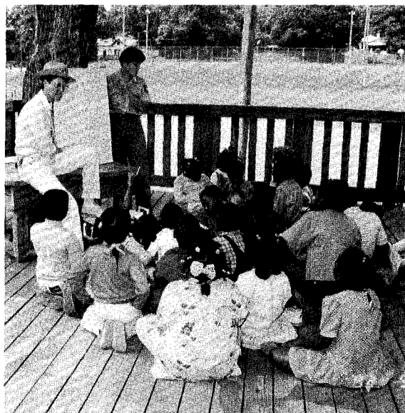
Figure 2. USDA Forest Service personnel and volunteers providing environmental instruction to children at the Atlanta Urban Tree House.

Athens, Georgia. Urban forestry research by the RWU located in Athens, Georgia, under the administration of the Southeastern Forest Experiment Station, has been concentrated on a cooperative venture to develop a national prototype of an inner-city forestry and environmental education facility in a city park in Atlanta, Georgia. The