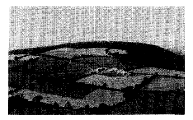
Fig. 2. Woodlands are the most potent tool for introducing extensive change into a landscape.

In conjunction with local research into recreation and environmental requirements, these assessments have allowed the teams to make recommendations on the scale and nature of the woodlands to be established within the various landscape zones they have identified.