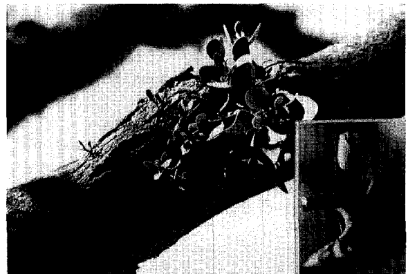
Figure 3. Characteristic regrowth of mistletoe shoots from buds formed at the site of infection. Mistletoe regrowth can occur within the first growing season. This photograph was taken two years after pruning the original cluster to a stub. INSET. Stub of mistletoe cluster treated with 10% ethephon shows no regrowth.