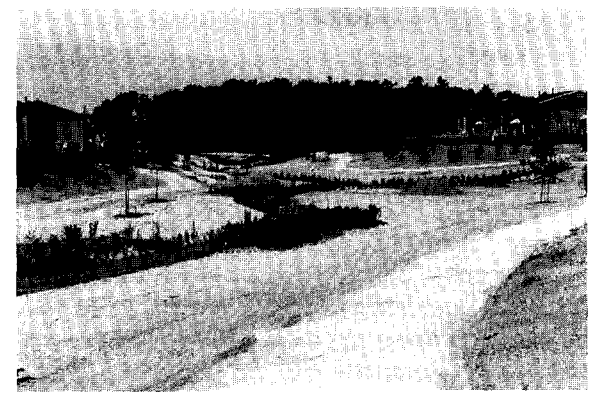
Figure 1. Storm water detention pond with naturalized plantings and trails.

To be effective, these policies must be implemented in a co-ordinated fashion by a wide cross-section of staff professionals: urban