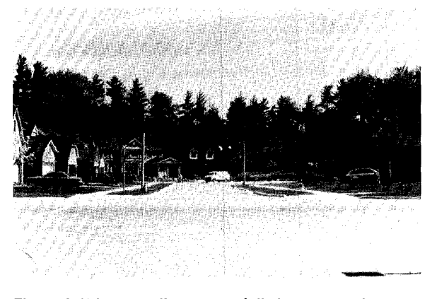
Figure 3. Urban woodlot successfully incorporated into urbanized area.