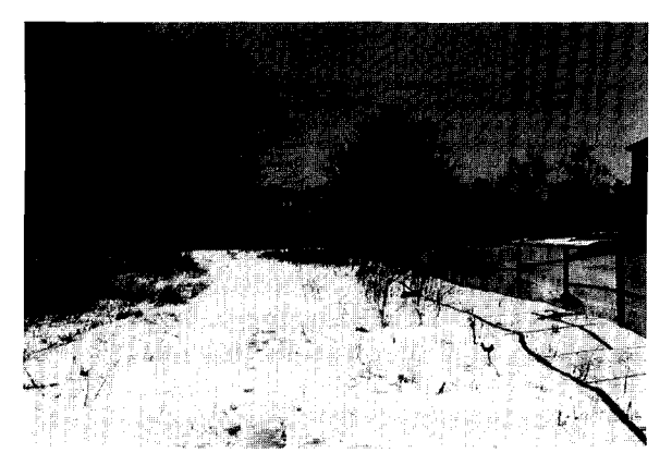
Figure 4. A 7.5 meter setback between the ravine top-ofbank and residential rear lot line.

builder applies for building permits. The municipality must apply strict management techniques at this stage. In Oakville, no building permits are released until the permanent, 1.2 meter high chain link fence is installed by the developer around all parkland. Fencing is an essential management tool to protect the natural woodland park. Formal park entrances ensure equal access to the trail system for all residents.