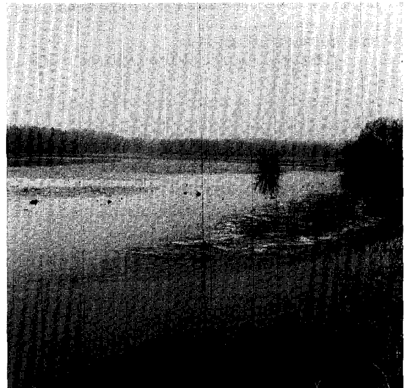
Figure 2. From the same aspect as Figure 1, the wetland is now mostly devoid of aquatic vegetation.

In addition, analyses of bottom sediments indicate relatively uncontaminated conditions, since heavy industry has been lacking in the watershed. It is also important to note that there has been a measurable reduction in nutrient loadings over the