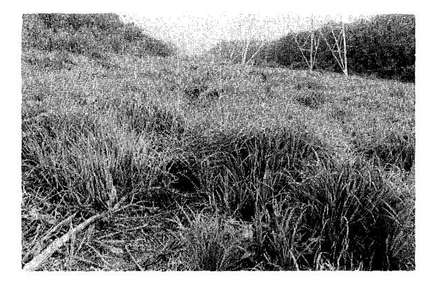
Figure 1. Grass cover type (tall meadow fescue) highly resistant to tree invasion.

Another important feature of ROW which affects the kind of cover type that will be produced by a ROW maintenance treatment is the presence of