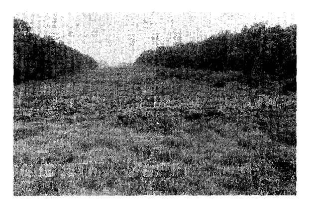
Figure 2. Shrub-grass cover type (blueberry-fescue) highly resistant to tree invasion.

The degree of resistance of various types of plant cover to tree invasion is an important factor in planning long-term maintenance of a transmission line. Each year a supply of tree seeds enters