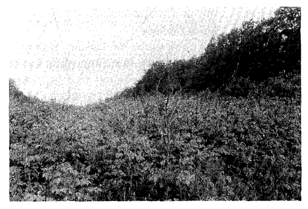
Figure 5. Shrub-herb cover type (blackberry-goldenrod) of low resistance to tree invasion.

A resistant grass-herb cover dominated by fescue grass, poverty grass, panic grass, hayscented fern and resistant shrubs may be en-