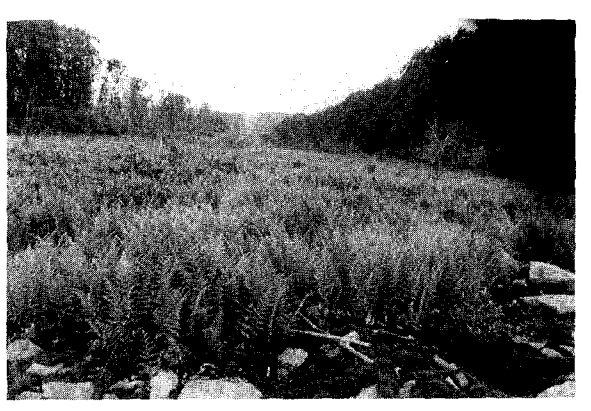
Figure 4. Herb-grass cover type (hayscented fernblueberry) resistant to tree invasion.