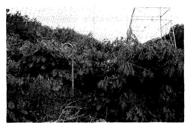
Figure 6. Tree-shrub-herb cover type (oak sproutsblueberry-goldenrod) of low resistance to tree invasion.

With the knowledge that has been accumulated on the effects of various common ROW maintenance techniques on plant cover, it is now possible to predict the type of ROW cover that will develop following application of those techniques