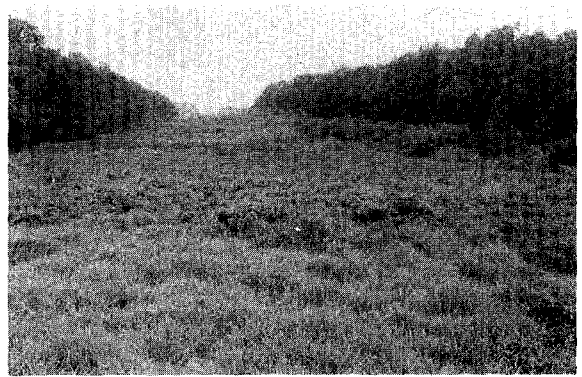
Figure 2. Shrub-grass cover type (blueberry-fescue) highly resistant to tree invasion.