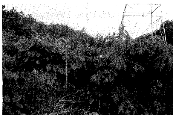
Figure 6. Tree-shrub-herb cover type (oak sprouts-blueberry-goldenrod) of low resistance to tree invasion.