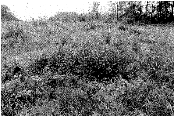
Figure 3. Herb-grass cover type (goldenrod-fescue) highly resistant to tree invasion.