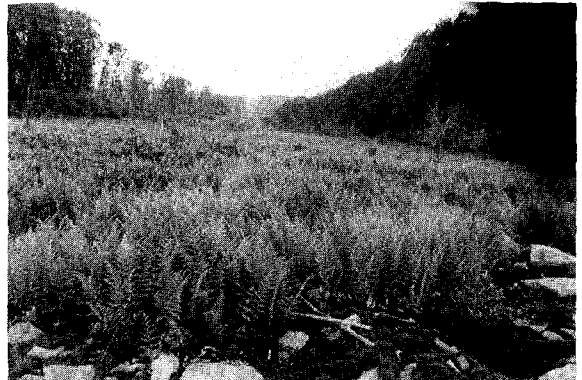
Figure 4. Herb-grass cover type (hayscented fern-blueberry) resistant to tree invasion.