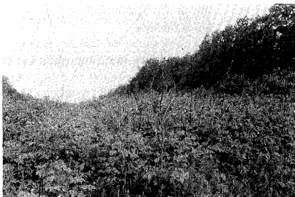
Figure 5. Shrub-herb cover type (blackberry-goldenrod) of low resistance to tree invasion.

With the knowledge that has been accumulated on the effects of various common ROW maintenance techniques on plant cover, it is now possible to predict the type of ROW cover that will develop following application of those techniques