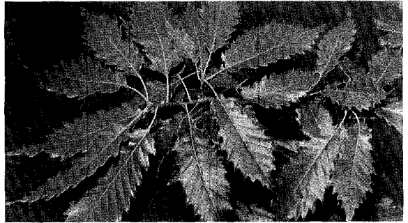
Figure 1. Chinquapin oak ( Quercus muhlenbergii ) occurs in nature on calcareous soils.

Throughout northeastern Illinois the glacial till underlying the natural soils contains countless fragments and particles of dolomitic limestone. In areas of urbanization, calcareous glacial material is commonly mixed with surface soil materials when large-scale landscape modifications are made. Urban soil often has pH values too high for proper growth of many tree species. Downtown areas appear to have soils progressively alkalinized by runoff from limestone and concrete surfaces that dominate the city center. The recent perceptible loss of sculptural detail on the facades of downtown buildings suggests that acid rain may be accelerating the dissolution of limestone and