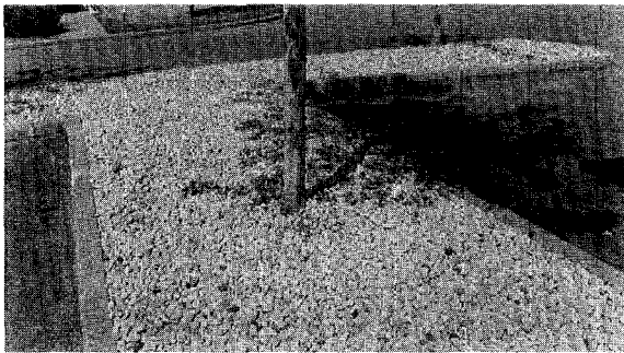
Figure 4. The limestone mulch surrounding a red maple ( Acer rubrum ) will slowly alkalize the soil, creating conditions unfavorable to the root system of the maple.

places and proper selection of trees (calciphytes) are definite near-term possibilities for improvement of urban landscapes. For example, in downtown areas greater use of large planter boxes (Fig. 3) would permit utilization of non-alkaline soil and the use of groups of appropriate woody calciphytes. Finding, selecting, and development of additional trees tolerant of soil alkalinity are urgent needs for improvement of urban landscapes.