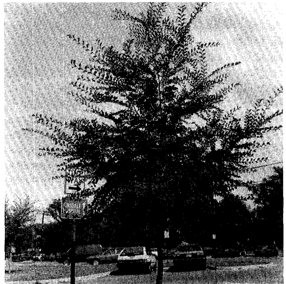
Figure 2. David elm ( Ulmus davidiana ) is an elm from northern China that thrives on calcareous clayey soil.