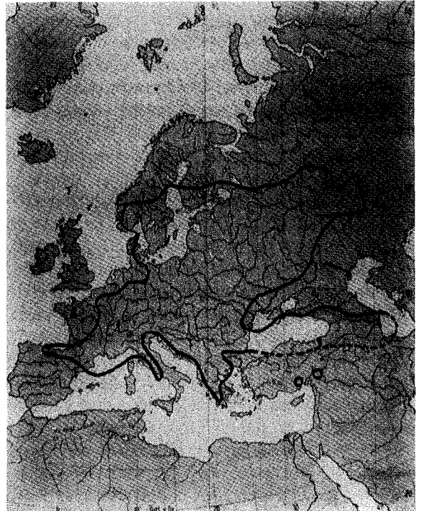
Figure 1. Native range of Acer platanoides L. (from citation no. 38).

The date 1762 also has been cited for the American introduction of Norway maple (25). This date was most likely obtained by searching through early seed catalogs (McGourty, pers. comm., 1985). The only two known nurseries operating in the United States in 1762 were Bartram's Garden in Philadelphia, PA. and Prince's