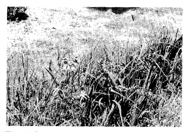
Figure 1. The greatest decrease in soil moisture occurred in bare soil plots where red maple and azaleas were wilting and dying due to weed competition.

While fabric or film/mulch combinations create moist, well-aerated media conducive to root