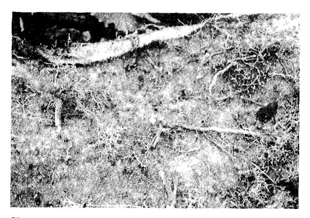
Figure 3. Red maple roots growing in, through and atop a spunbonded fabric.

Miscellaneous. Runs of voles were more prevalent under plastic and the fabrics/film than under the bare ground, herbicide or mulch-alone coverings (Figure 4). Since voles are vegeterians, their increased presence under the fabrics/films could potentially increase tree and shrub injury via their feeding on roots. Davies (3) noted an increase in field vole nesting under polyethylene