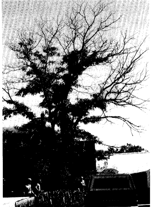
Figure 2. Dieback and decline of honeylocust approximately 20 years old. Thyronectria canker contributes to these symptoms.