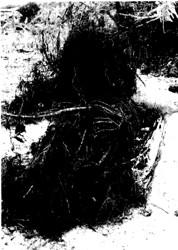
Figure 2. Root regeneration typical of 'Imperial' honeylocust by September 1986. Trees were transplanted in April 1986. This type of root regeneration was typical in all trees, regardless of "ball" type.

Trees given the wide-deep and wide-shallow configurations had significantly greater shoot growth in 1987 than trees given the standard and narrow-deep configurations. Shoot growth in 1987 of trees given the wide-deep configuration 99% of the shoot growth in 1985. Shoot growth for trees given the wide-shallow root configuration was 83% of the growth in 1985. Averaged over