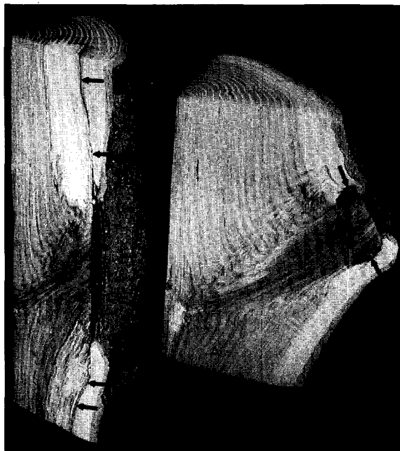
Fig. 3. Oak branches are from the same tree. B was pruned flush and A was pruned with a proper cut. Both are closing well but B has extensive decay in the stem above and below the cut where A has none. Proper pruning cuts lower the potential for hazards and may reduce the frequency of sprouting.