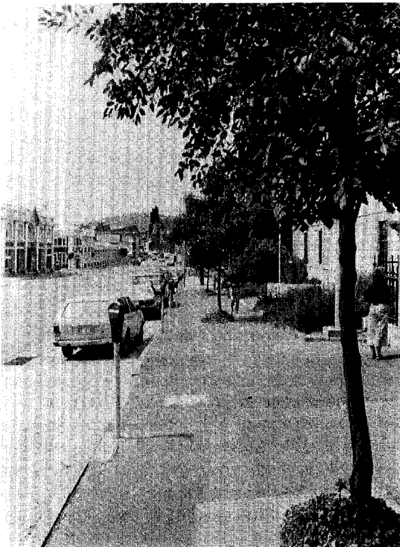
Fig. 1. Alnus incana and A. glutinosa along Macquaire Street in Hobart.

One of the current problem areas of tree management in Hobart is in relation to public requests concerning individual trees. These are generally telephone requests that cannot be resolved immediately because the Arborist had no previous ready access to information in order that claims can be validated and an appropriate course of action implemented. Time consuming inspections were consequently necessary to satisfy the query. With computerized tree records, detailed information such as species and site