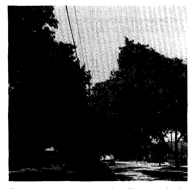
Fig. 1. Trimming parkway trees by utility companies for clearance of electrical transmission lines.

The trimming of trees for the clearance of electrical transmission lines is a very important function of utility companies in order to maintain uninterrupted service. However, this type of trimming work is not perceived very favorably by most homeowners and often meets with resistance and objections by citizen's groups. Our local electrical company, Commonwealth Edison, contracts with a private tree service company for tree trimming clearance of electrical wires in the Chicago area. Prior to the start of any electrical line trimming projects, whether the trees are located on City property or in backyards, the representative of the electric company contacts me, and we sit down and discuss the type of trimming that they plan to do at each of the various locations and when the work will start. We insist that the property owners be notified in advance of the scheduled line trim-