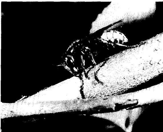
Figure 1. European hornet worker removing bark of Chinese ash.

The first report of tree damage by this insect in the United States was made by Thomas Meehan, a Philadelphia nurseryman, in 1878 (10). (Although Meehan was under the impression he was observing D. maculata , it is clear from his description that the insects were indeed V. crabro .) He reported that young branches of Euro-