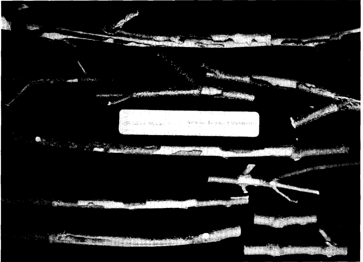
Figure 3. European hornet damage on (above ruler) Japanese white birch and (below ruler) green ash. The upper branch of birch was girdled and was killed. Other branches were not girdled but little callus formed. Upper branch of ash was girdled and middle 2 branches were not. These branches were removed during the dormant season

The amount of bark removed at any one site on the ash trees varied from small patches only about 1 cm 2 to long irregular patches that girdled the branch (Fig. 3). When ash branches were not girdled, vigorous callus growth was initiated the following season, sometimes completely covering the bare wood that had been previously exposed