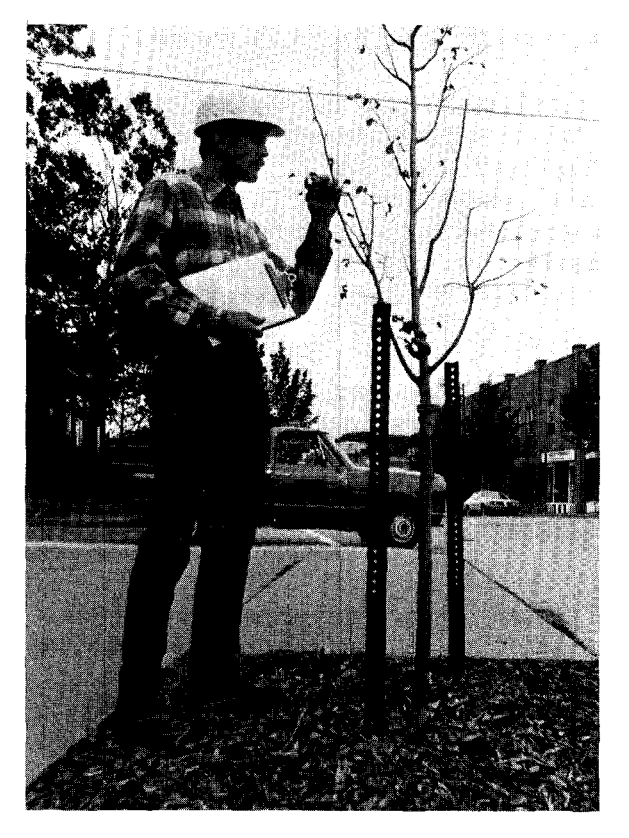
Figure 4. Performance tests in urban environments are needed to compare cultivars in survival, growth, health, and maintenance cost.

Number of plots. The number of plots recommended for a test depends on the sizes of the