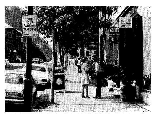
Figure 1. Selecting trees for particular urban sites is difficult due to insufficient information about performance under city conditions.

The basic operation of STRETEST is not complicated. The choice of trees to be tested is made according to requirements for information and the types of planting spaces available. Test trees are purchased and planted as part of the normal plantings along streets or highways, or in parks and other open areas where appropriate space is available. Some restrictions in numbers and arrangements of the trees are necessary to accommodate data analysis. Data are recorded by the arborist in late summer each year. Comparisons and evaluations are made by the arborist, perhaps with the assistance of a specialist in statistical analyses. Trees are evaluated as to survival, growth, health, causes of injuries, maintenance needs, and suitability for various types of sites.