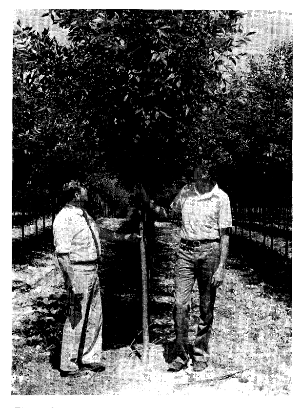
Figure 2. Nursery data on new cultivars is useful mainly for traits under strong genetic control in diverse environments.

Tests are designed each year by deciding upon the type, size, number, and locations of plots to be established, so the test will fit into available and appropriate spaces.