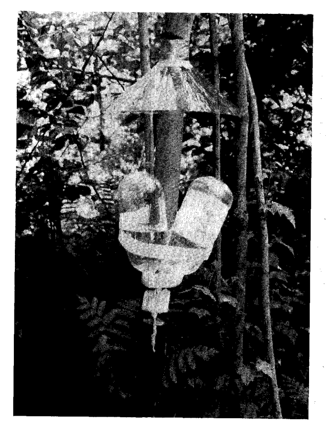
Figure 2. Plastic bottles containing solutions mounted over a wound and protected from ambient rain by an acetate collar.

The amount of discolored wood measured in the wounds of various treatments is presented in Table 1. Acidity per se had no effect on the amount of discolored wood; in red maple comparable areas of discoloration were measured in wounds of trees exposed to solutions of pH 3.0 and 5.8 (Figure 3) or pH 4.0 and 5.8 at points 0.5 or 2.5 cm above the wound. When rain was excluded from the wound by a plastic shield, the area of discoloration was similar to that found in the acidified wounds. In the ambient rain treatment (weighted mean, pH 3.98) the amount of