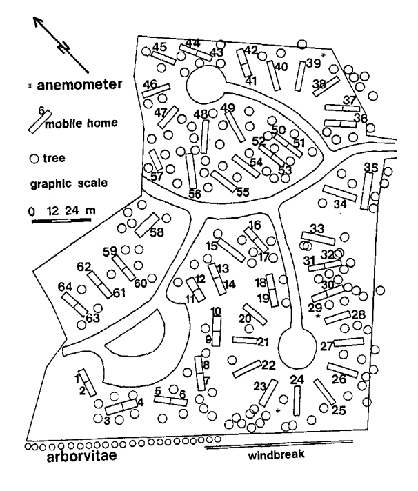
Figure 1. Layout of the mobile home park, homes, existing landscape vegetation and the windbreak.

The mobile home park was situated on gently rolling terrain, with elevations ranging from 373 to 384m toward the north. Abundant vegetation was present in the park and consisted mainly of medium height trees and small shrubs. The position of the trees is indicated on Figure 1. On this figure, note the row of arborvitae ( Thuja occidentalis ) shrubs running along half the western edge of the park; these shrubs were about 1m high and 50cm wide, and spaced 1m apart. The park was located on the eastern side of a large field (not cultivated in winter) which provided an unobstructed upwind distance of at least 150m