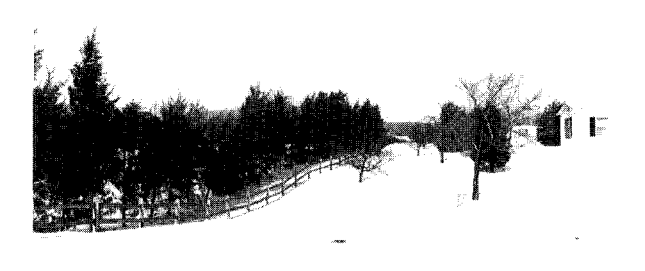
Figure 2. White spruce windbreak erected along the western border of the mobile home park.

for the prevailing westerly winds. The windbreak was placed on the western side of the mobile home park, 3H from the closest mobile home (H is the height of the windbreak). The windbreak was composed of a single-row of 39 white spruce ( Picea glauca (Moench) Voss.) trees, with 3 meters spacing between the trees, and an average tree height of 6 meters in place (Figure 2). The trees were cut on University experimental plots, transported to the study site, put in 60cm deep holes, and guyed with wires. The trees were in place at the mobile home park from December 15, 1981 through March 21, 1982.