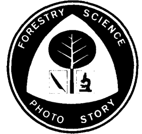
PHOTO STORY No. 26

The houses pictured are identical in architecture. Yet the one on the right sells for $2,700 more than the one on the left. The reason? Trees!