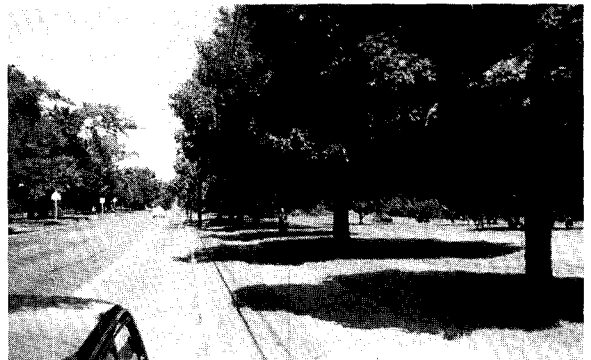
Figure 1. Properly planned, planted and maintained trees are an asset and beauty for a city. This information can be used to sell your budget.

Trees can also have a negative effect on a city's budget. Improper planting and maintenance can greatly increase the cost of municipal government. Proper selection of tree species and sites could reduce or even eliminate utility line pruning and sidewalk/curb damages (Figure 3) caused by tree roots. The utility line clearance cost to CON ED for Westchester, New York is $2.2 million per year to trim and remove trees along 16,300 miles of overhead wires (1).