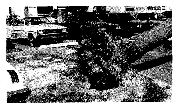
Figure 2. One does not have to be a prophet to know that this tree was a prime candidate for windthrow. In fact, it blew over like a matchstick in a thunderstorm in which winds reached 40 mph (estimated). Note absence of root system. Trees which are seriously stressed due to construction damage, insects or diseases should be removed to protect life and property.