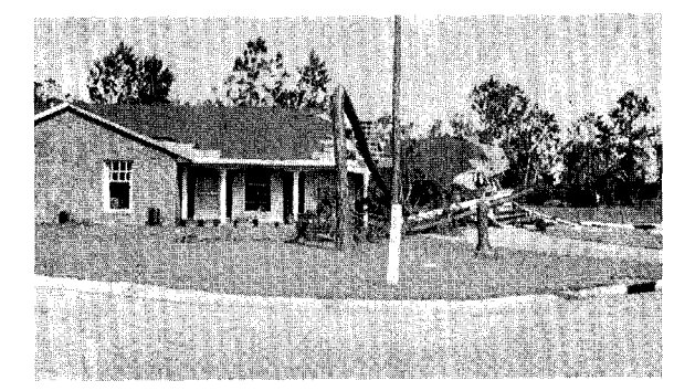
Figure 3. Tall, densely crowned trees with little taper are prime candidates for breakage and windthrow in hurricaneforce winds. Each landscape should be surveyed to identify "dangerous" trees that could pose a threat to life and property (see tables). Consideration should be given to removing dangerous trees if they are within striking distance of a building.