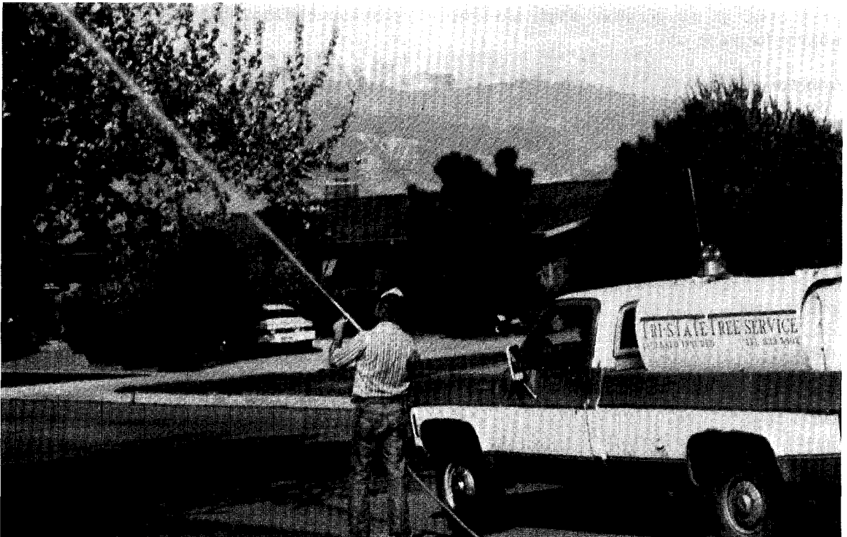
Fig. 2. A local tree service company, under contract to the city, applying a bactericide to minimize the possibility of fire blight infection.

Regional parks and urban trees are managed to promote urban wildlife. Dead trees not in heavily used areas are designated as wildlife trees, and are saved for that use. park development is