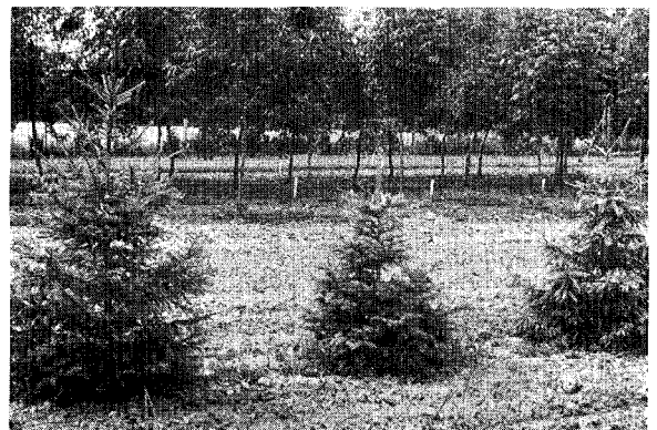
Fig. 5. Norway spruce 15 months after transplanting. Treatments left to right: B&B; Wilt-Pruf NCF; Wilt-Pruf NCF + PF poly bag.