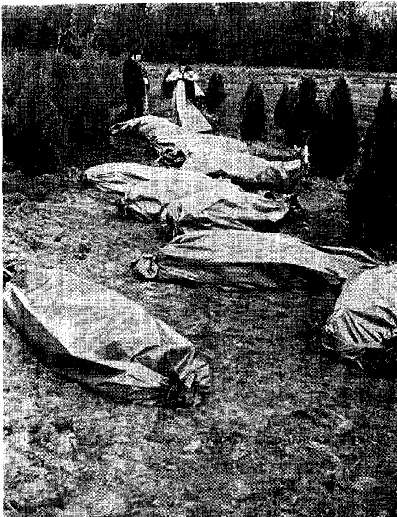
Fig. 2. Bare-root Keteleer juniper enclosed in PF poly bags.

Juniper. Plants in all bare-root treatments sur-