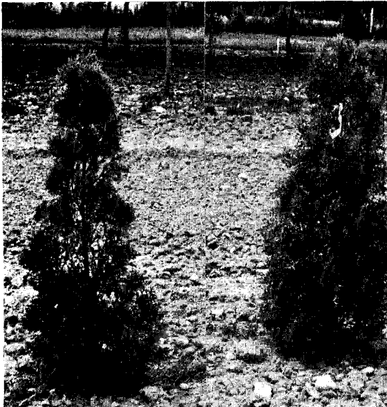
Fig. 6. Pyramid white cedar 15 months after transplanting. Left: Wilt-Pruf NCF + PF poly bag; Right: B&B (foliage more dense).

effect of Agricol on the plants. Agricol was not used in further trials due to the inconvenience in handling and lack of positive benefits. Mullin (1977) found no advantage in dipping roots of Jack pine or black spruce seedlings in Agricol prior to storage. The benefit of Agricol might be realized to a greater extent in situations where roots could not be wrapped immediately after lifting or during periods of very low relative humidity since the exposed solution remained moist during transport and overnight storage of yew and Grey Rock juniper plants.