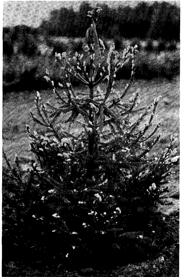
Fig. 4. Norway spruce after storage for two weeks in a PF poly bag showing etiolated shoot tips.

The Agricol root dip treatment provided no foliar protection against water loss and the small amount of moisture held around the roots by Agricol provided little water for uptake to counteract the loss through transpiration, resulting in greater foliar injury of yew than with other treatments. Foliar injury of yew treated with Agricol combined with Wilt-Pruf NCF + PF poly bag was similar to that of plants treated with either Wilt-Pruf or poly bag alone indicating no adverse