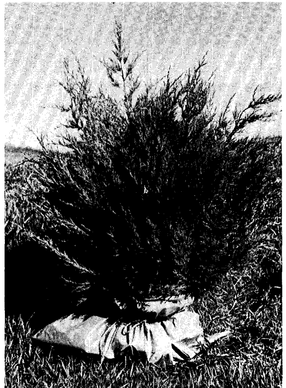
Fig. 1. Bare-root Grey Rock juniper treated with foliar antidesiccant and root-wrapped in PF poly bag.

Experiment 2. Based on the findings of the first experiment plant size was increased to 1.5-1.75m using Keteleer juniper ( Juniperus