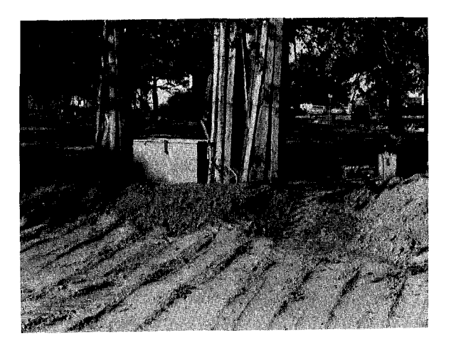
Fig. 2. Careful protection to the trunk of these oaks offers no protection to the root system as heavy equipment cuts away and compacts the root system.

same. Certain restrictions could then be placed on the developer relative to cut and fill procedures and ditching. Likewise, home builders should be made responsible for the stresses placed both on city-owned trees and trees on residential lots. This would provide more protection to the homeowners who have bought a home with trees, many of whom now find their wooded lots less wooded than they were when the property was acquired.